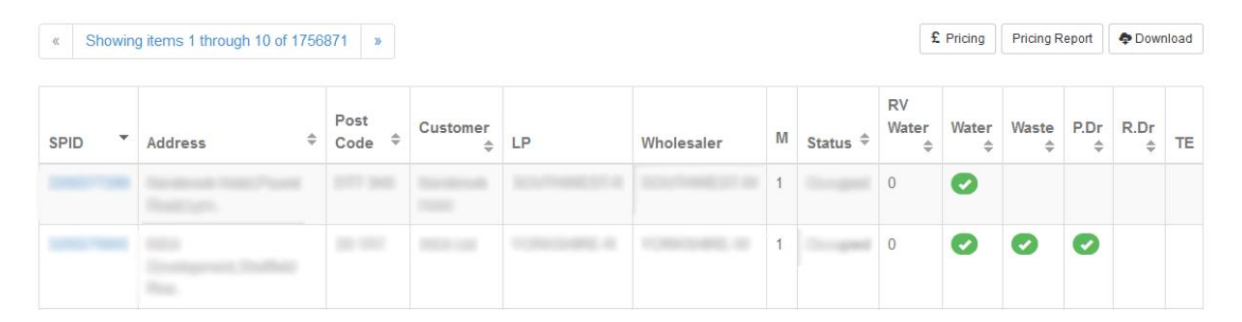
Figure 3 – Edge Market Search Results

Search results are displayed in a tabular format, providing ease of review and selection.